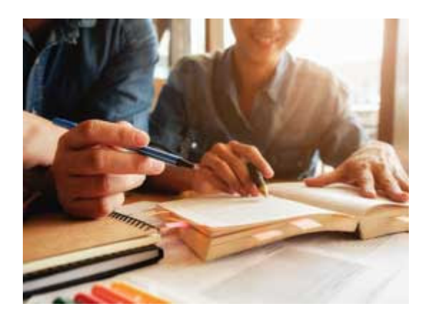
Congratulations to all the recipients of Unifor's 2020 scholarships – 28 prizes of $2,000 each across Canada to help make education more accessible.