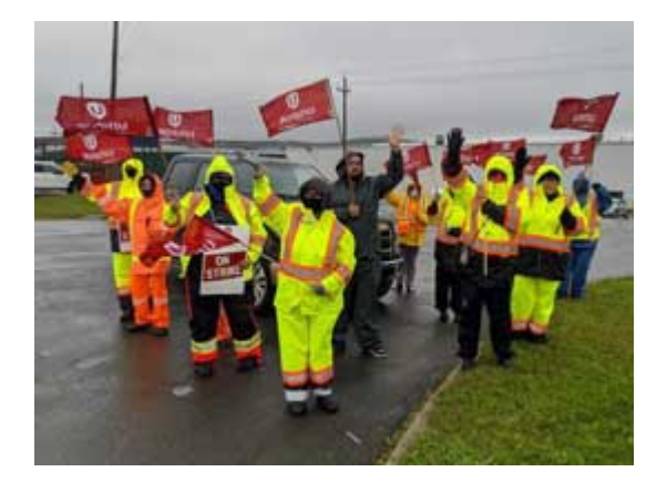
Striking Dominion workers rallied today as they face court action by Loblaw Companies Limited.